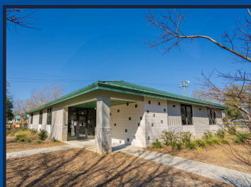
Maple Park Community Center

February 24, 2025 1700 S. Rutherford Drive