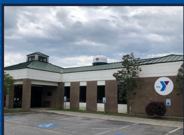
Florence Family YMCA

February 24, 2025 1700 S. Rutherford Drive