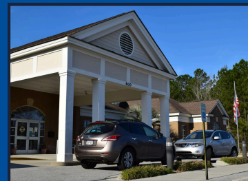
Leatherman Senior Center

February 18, 2025 356 S. Jeffords Street