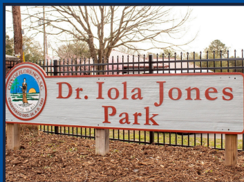
Dr. Iola Jones Park Community Center