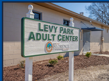
Levy Park Adult Center

February 18, 2025 356 S. Jeffords Street