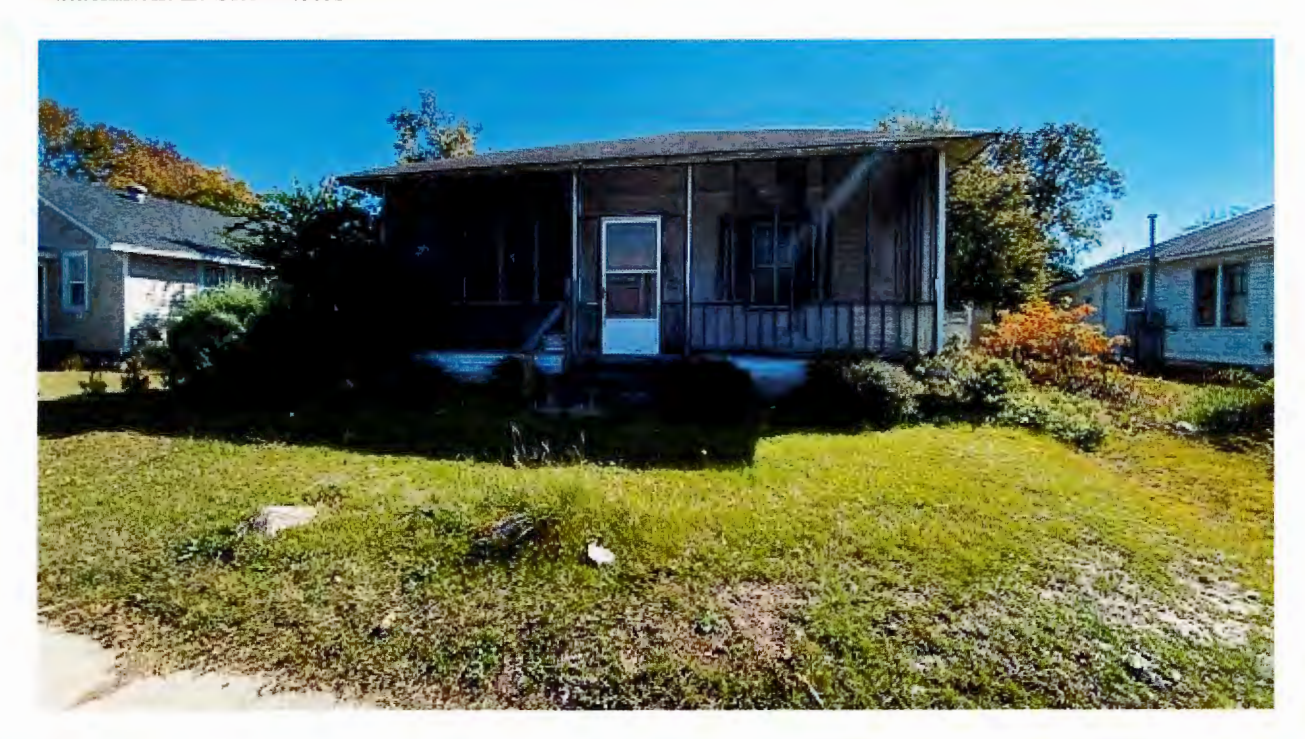
Attachment E: Site Photos