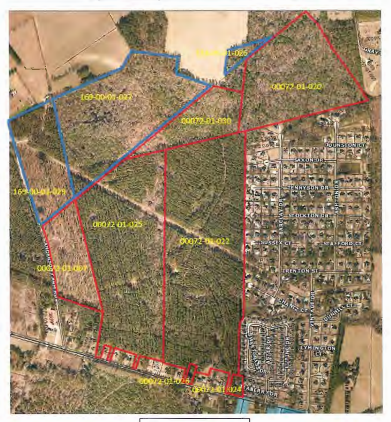
Ingram Tract/Magnolia Farm Subdivision Parcel Map