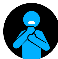
Shortness of Breath